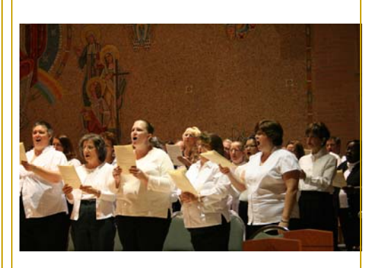
St Cecilia Sing Mass Choir 2008